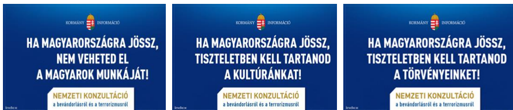
Figure 4: Phase 1 'If you come to Hungary' billboard campaign against migrants and refugees by Hungarian government

1. If you come to Hungary, you cannot take away the work of the Hungarians!