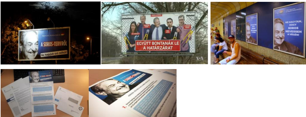
Figure 6: Phase 3 Hungarian government campaign against George Soros

Viktor Orbán continues his campaign series in phase 3 directly on George Soros. Orbán claims that Soros's plan is supported by Brussels, allowing a foreign international organization on settling one million migrants in Europe. Europe will become unrecognizable by a flood of Muslim refugees once Soros and his allies succeed in opening the borders. The Hungarian government amplifies this campaign against Soros by passing a 'stop Soros' law on June 2018, a purpose of this law is to strictly prohibit providing any kind of assistance to undocumented immigrants from individuals and organizations. This law means Hungarian government will have an extra power to jail its political opponents by accusing them for 'helping the refugees'. To conclude, "Stop Soros" law is a bill that human rights advocates fear will be used to shut down opposition groups and civil society.