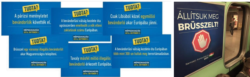
Figure 5: Phase 2 'Did you know?' billboard campaign against migrants and refugees by Hungarian government