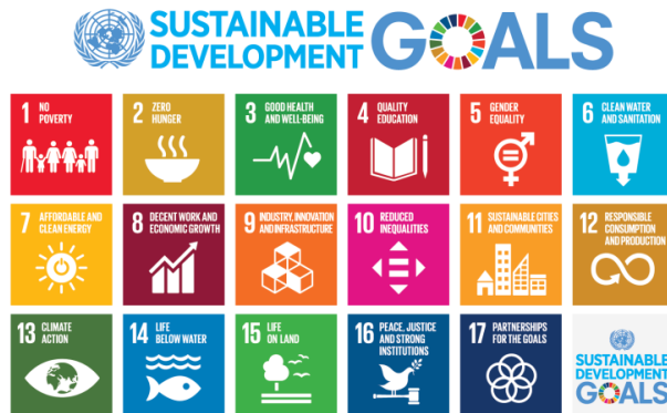
Figure 1: Seventeen SDGs

there is a shift in the common paradigm towards the socio-economic context in which firms operate, the United Nations created the Global Compact, in which firms adhere and commit to 10 principles related with the reduction of environmental impact, further respect for human rights and labor rights, and a constant fight against corruption. With this, there were regional and local governments that also adhered to the initiative, considering the alignment with these principles was in favor of the overall community they were representing. In addition, the UN further enhanced the commitment by determining 17 specific goals for a global sustainable development to deter the current impact of human behavior, Figure 1 summarizes those goals commonly referred to as Sustainable Development Goals (SDGs).